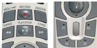
Push buttons and four fully programmable function buttons