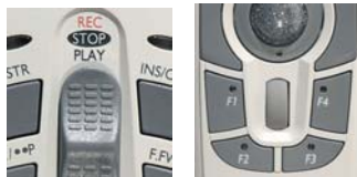
International 4-position switch REC/STOP/PLAY/F.RWD and four fully programmable function buttons